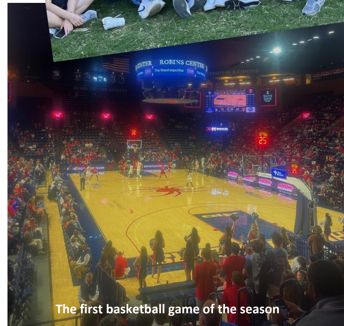
The first basketball game of the season