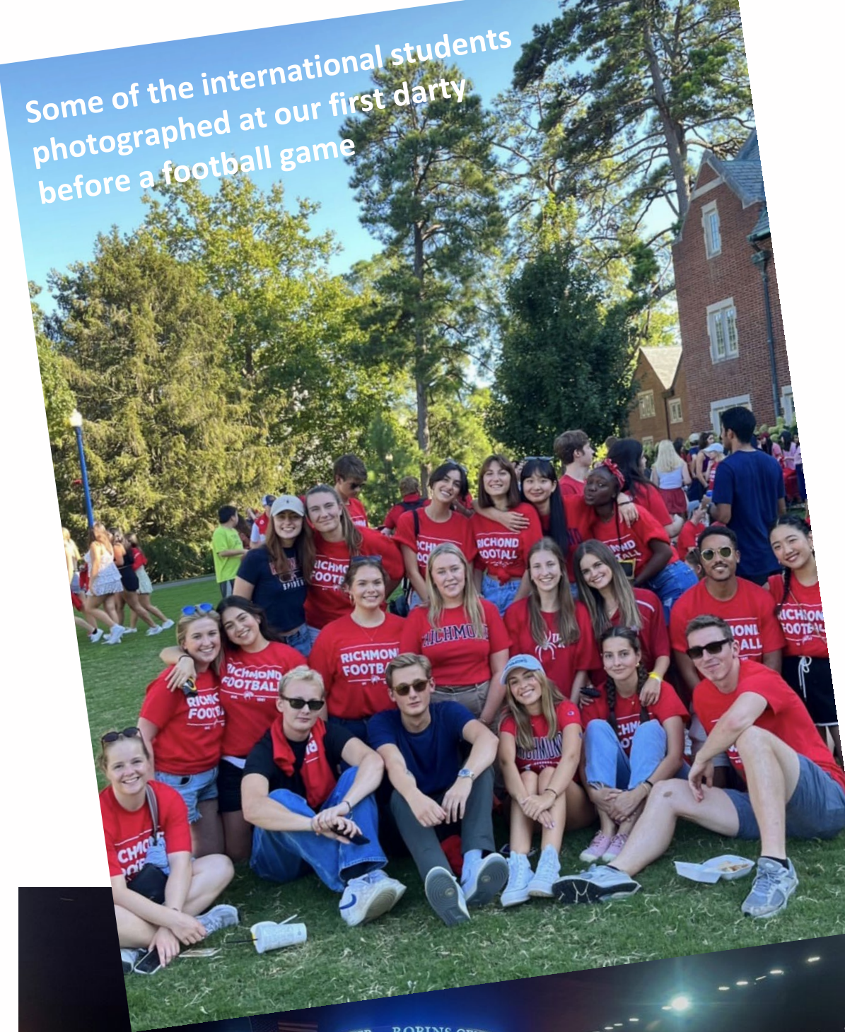
Some of the international students photographed at our first darty before a football game