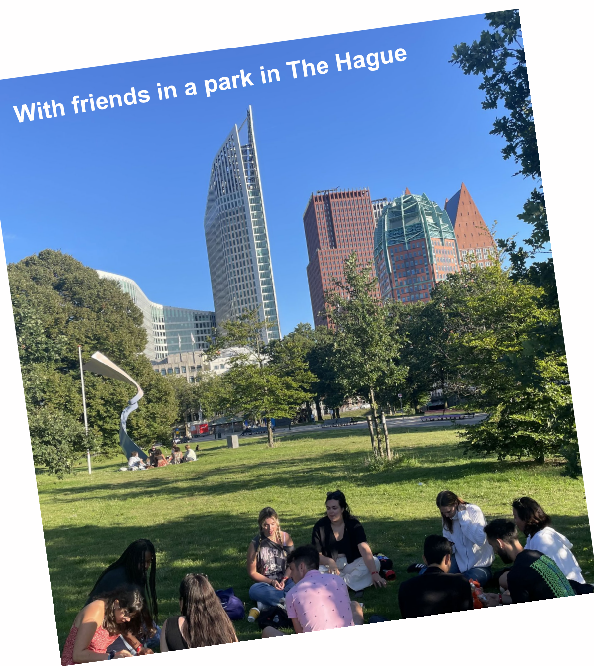
With friends in a park in The Hague