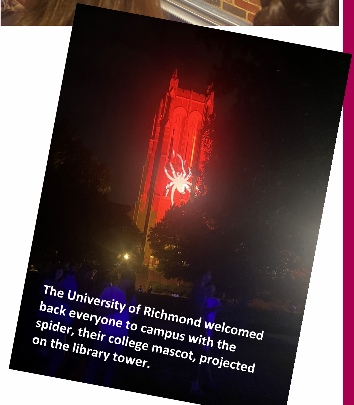
The University of Richmond welcomed back everyone to campus with the spider, their college mascot, projected on the library tower.