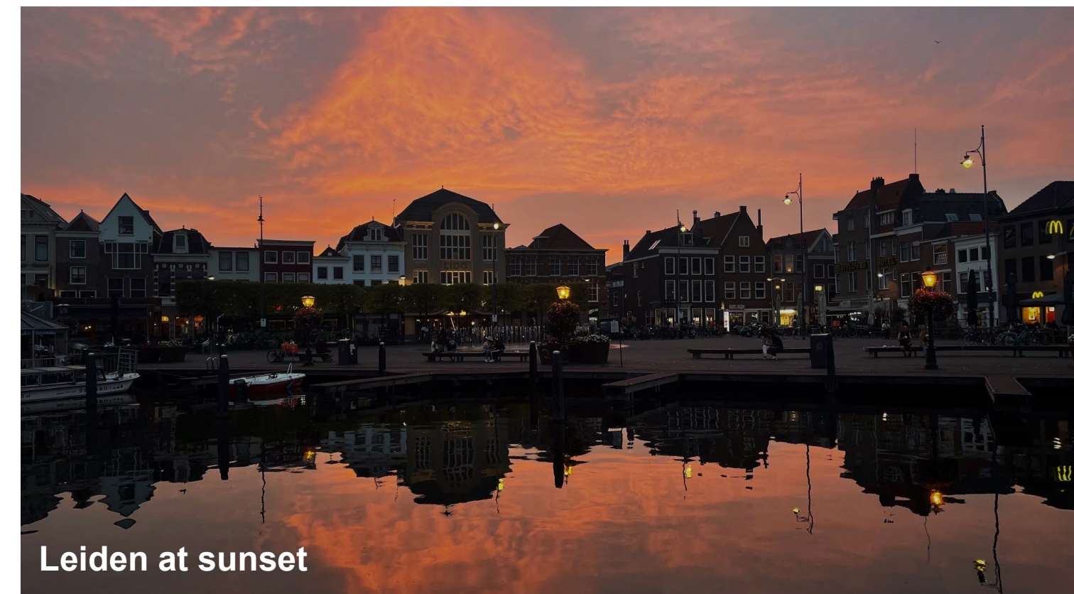
Leiden at sunset