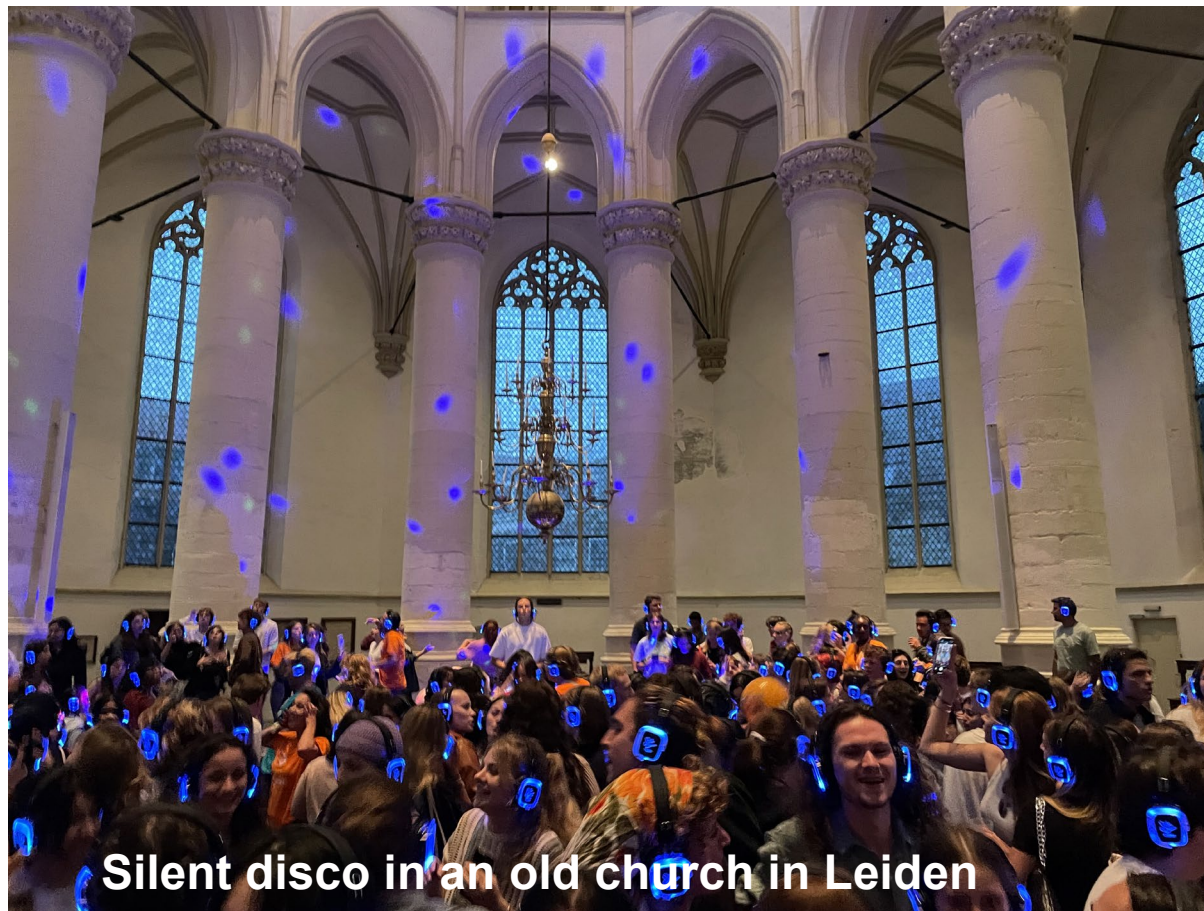
Silent disco in an old church in Leiden