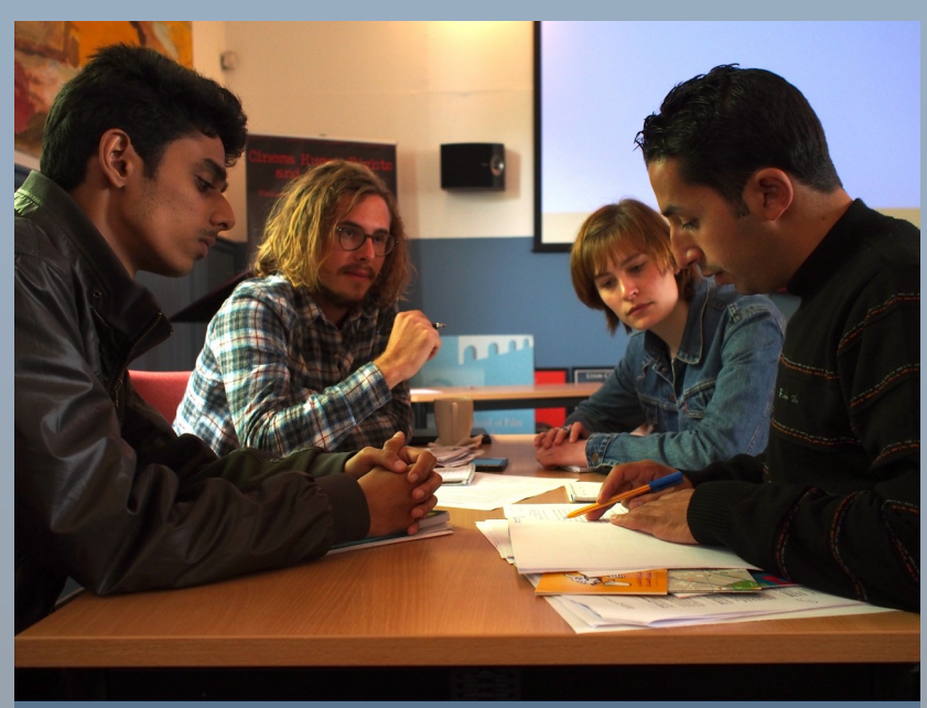
Participants: Cinema, Human Rights & Advocacy Summer School 2013

From June 27 to July 6, the Huston School of Film & Digital Advocacy (CHRA) in Galway. The CHRA summer school took place Media and the Irish Centre for Human Rights successfully in the seminar room of the Huston School of Film & Digital Media, hosted the 4th Summer School in Cinema, Human Rights and and reflected upon the use of film and video advocacy as an in-