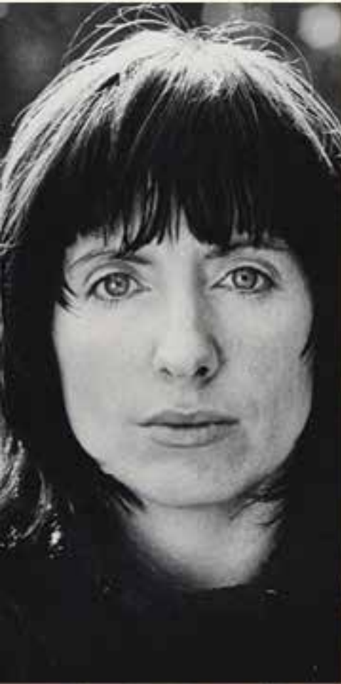
Caitlín Maude circa 1970s, reproduced by kind permission of the RTE Press Centre.

Caitlín Maude (1941-1982) was born in County Galway and educated in Coláiste Chroí Mhuire, An Spidéal and UCG (BA 1962).