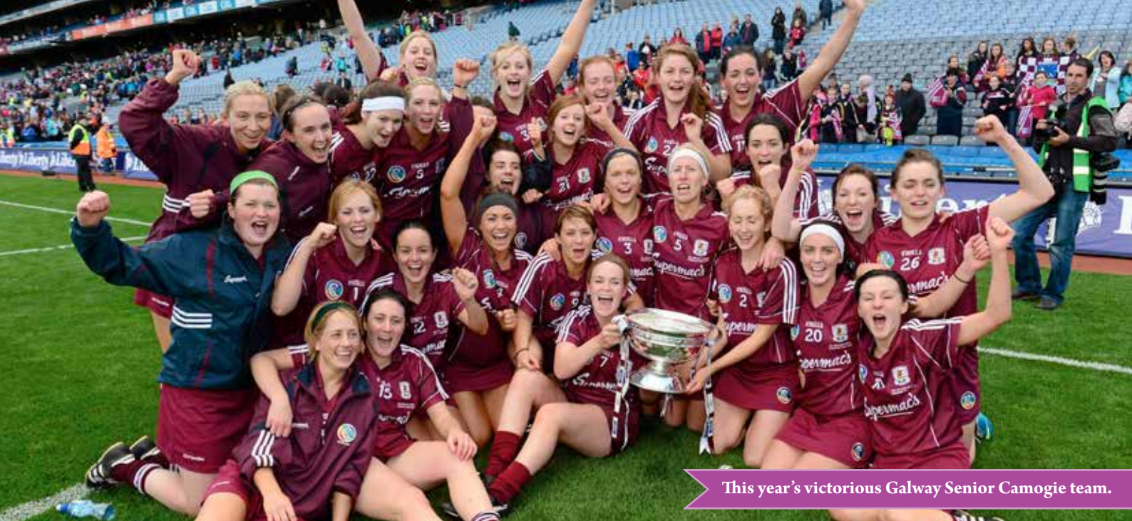
This year's victorious Galway Senior Camogie team.