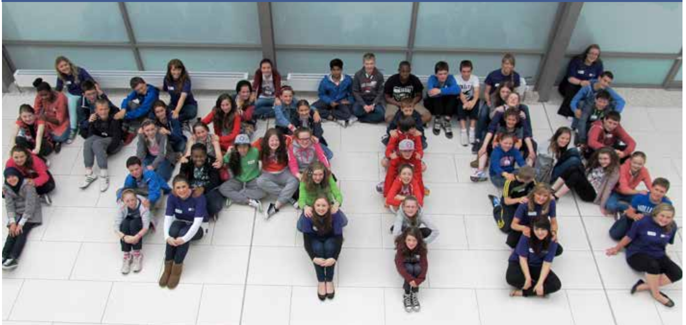
Sixth class primary pupils at the School of Education's four-day Maths Summer Camp spell out their new favourite subject. Later, the School of Mathematics celebrated Maths Week in October with a week of activities and workshops for school children.